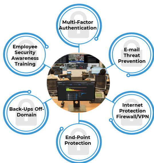
Managed User Based Layered Security